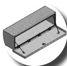
Aluminium tool box