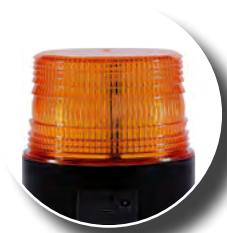
LED warning light