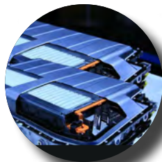
6 hours with two accumulator